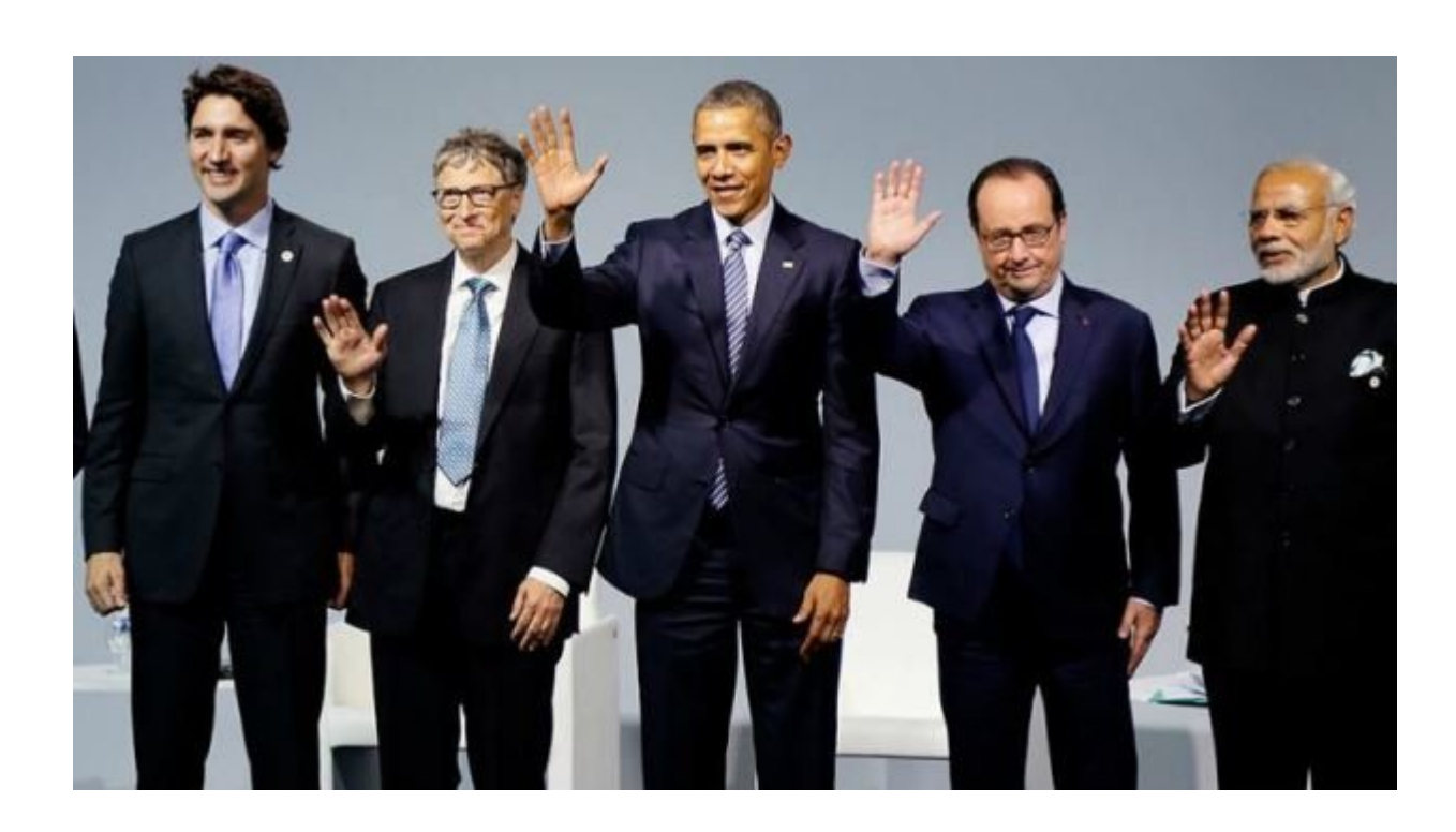
Canadian Prime Minister Justin Trudeau, Microsoft co-founder Bill Gates, Former US President Barack Obama, French President Francois Hollande and Indian Prime Minister Narendra Modi at the Paris Climate Conference in 2015.

After rising by 0.113C per decade between 1950 and 1999, temperatures appeared to have stabilized between 2000 and 2014, despite rising levels of CO2 emissions, which climate change scientists said were responsible for the earlier warming.